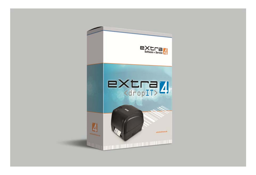
Fig.3: Software tool eXtra4<dropIT> for label printing from third-party systems via copy & paste